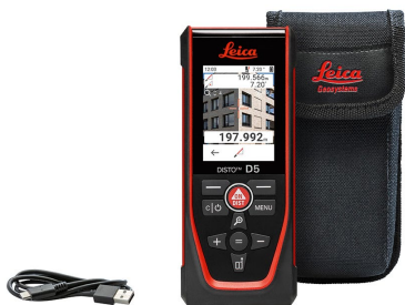
Leica DISTO™ D5 Art. No. 950908

Leica DISTO™ D5, Pouch, USB-C to USB-A Cable, Hand Loop, Quick Start Guide, Warranty card, Safety Manual, Calibration Certificate Silver