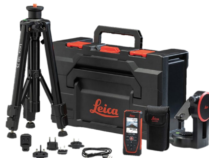
Leica DISTO™ D5 Package Art. No. 950879

Leica DISTO™ D5, Pouch, USB-C to USB-A Cable, Hand Loop, Quick Start Guide, Warranty card, Safety Manual, Calibration Certificate Silver